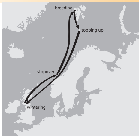
Figure 7-2. Migratory flyway of the barnacle goose population wintering in southwest Scotland and breeding on Spitsbergen. In early spring they track the spring flush in grass growth to the Norwegian coast near the Arctic Circle where they stop to fatten up. From this stopover they fly directly to Spitsbergen. On the southward journey they often stopover on Bear Island before resuming their flight to Scotland. This journey with long sea crossings is an energetic challenge that many goslings do not survive.

sit times instead. With few exceptions the ingested plant matter leaves the goose's body after just 90 minutes! Cellulose is not digested at all, and the related hemicellulose only partly. This means that geese must select the most digestible grasses they can find. Like other animals, geese cannot synthesise the essential amino acids that make up proteins so they are especially choosy in selecting