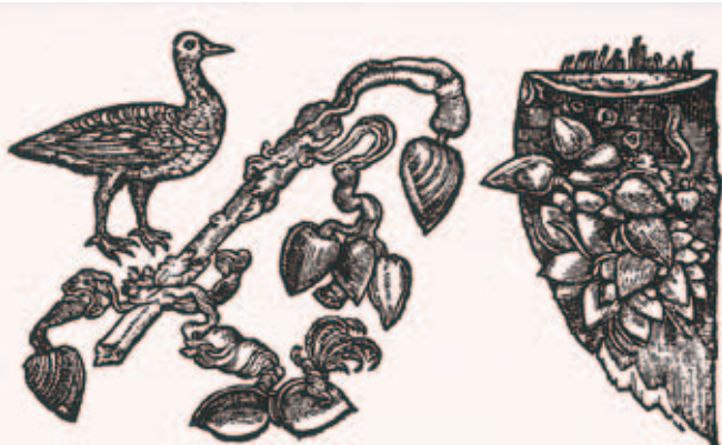
Figure 7-1. An illustration from Gerard's Herbal (1633) showing how barnacle geese develop from barnacles in early life, a persistent myth.