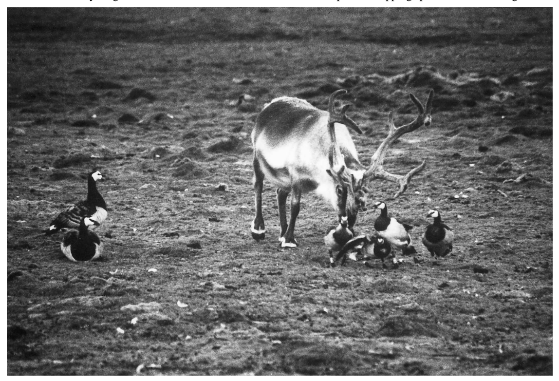
Fig. 2. A male reindeer chases young Barnacle Geese in order to consume the fresh pile of droppings produced while the geese were resting.

potassium or avoidance of magnesium and sodium could explain the observed preference for grass droppings over moss droppings.